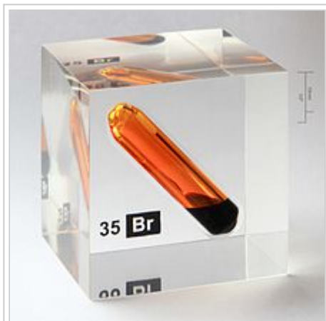
Illustrative and secure bromine sample for teaching

Bromine is the third halogen, being a nonmetal in group 17 of the periodic table. Its properties are thus similar to those of fluorine, chlorine, and iodine, and tend to be intermediate between those of the two neighbouring halogens, chlorine and iodine. Bromine has the electron configuration [\text{Ar}]3d^{10}4s^24p^5 , with the seven electrons in the fourth and outermost shell acting as its valence electrons. Like all halogens, it is thus one electron short of a full octet, and is hence a strong oxidising agent, reacting with many elements in order to complete its outer shell. [17] Corresponding to periodic trends, it is intermediate in electronegativity between chlorine and iodine (F: 3.98, Cl: 3.16, Br: 2.96, I: 2.66), and is less reactive than chlorine and more reactive than iodine. It is also a weaker oxidising agent than chlorine, but a