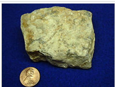
Beryllium ore with 1US¢ coin for scale

Beryllium is found in over 100 minerals, [23] but most are uncommon to rare. The more common beryllium containing minerals include: bertrandite ( \text{Be}_4\text{Si}_2\text{O}_7(\text{OH})_2 ), beryl ( \text{Al}_2\text{Be}_3\text{Si}_6\text{O}_{18} ), chrysoberyl ( \text{Al}_2\text{BeO}_4 ) and phenakite ( \text{Be}_2\text{SiO}_4 ). Precious forms of beryl are aquamarine, red beryl and emerald. [6][24][25] The green color in gem-quality forms of beryl comes from varying amounts of chromium (about 2% for emerald). [26]