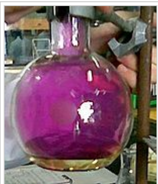
Violet iodine vapour in a round-bottomed flask

on the Pauling scale (compare fluorine, chlorine, and bromine at 3.98, 3.16, and 2.96 respectively; astatine continues the trend with an electronegativity of 2.2). Elemental iodine hence forms diatomic molecules with chemical formula I_2 , where two iodine atoms share a pair of electrons in order to each achieve a stable octet for themselves; at high temperatures, these diatomic molecules reversibly dissociate a pair of iodine atoms. Similarly, the iodide anion, I^- , is the strongest reducing agent among the stable halogens, being the most easily oxidised back to diatomic I_2 . [14] (Astatine goes further, being indeed unstable as At^- and readily oxidised to At^0 or At^+ , although the existence of At_2 is not settled.) [15]